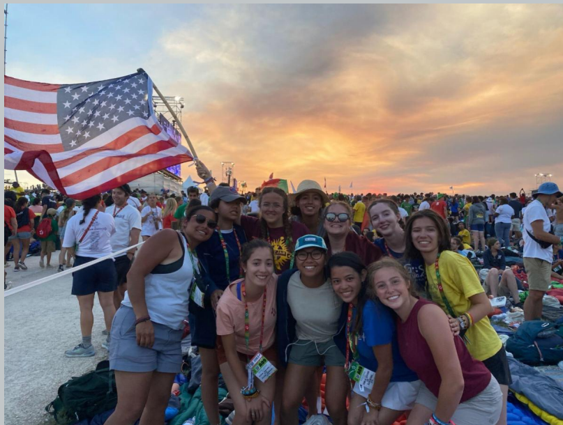
Loyola Students at World Youth Day 2023 - Lisbon, Portugal

This pilgrimage made my heart grow, challenged me, and taught me what I couldn’t have learned anywhere else. It’s okay that prayer, that God, isn’t put in a box. That He is bigger than the tabernacle, that He is grander than wrote prayers or silence, and He is everywhere, not only in the beautiful, reverent, but narrow Catholicism that I have practiced up until now.